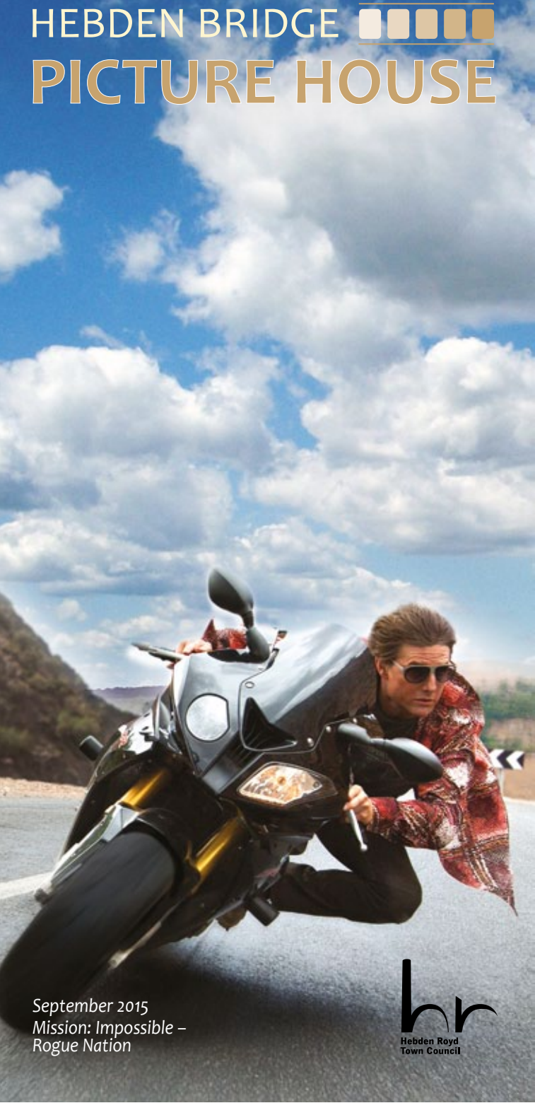
September 2015 Mission: Impossible – Rogue Nation