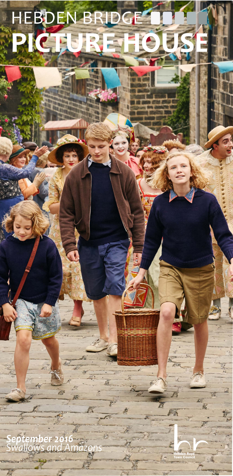
September 2016 Swallows and Amazons