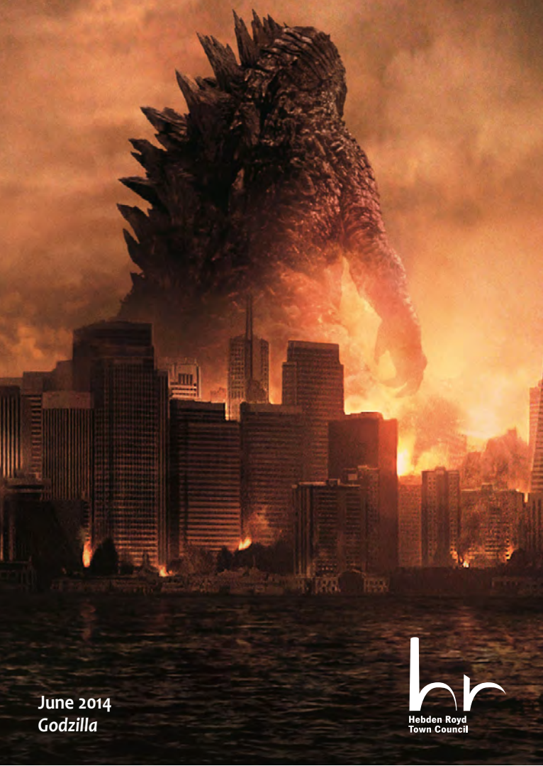
June 2014 Godzilla Hebden Royd Town Council