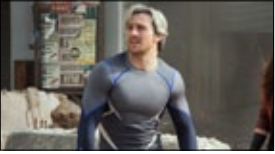
AVENGERS: AGE OF ULTRON (12A) Sat 23rd to Thurs 28th May