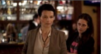
CLOUDS OF SILS MARIA (12A) Dir: Olivier Assayas |USA |2014 | 124 mins Cast | Juliette Binoche, Kristen Stewart

Juliette Binoche and Kristen Stewart are fantastic in Oliver Assayas' (Something in the Air) complex, bewitching drama. Binoche is Maria, an actress whose career is on the wane, served by her smart PA Valentina (Stewart) and Jo-Ann, a young actress (Chloe Grace Moretz) eager to take Maria's crown. Witty, captivating and insightful, it's a modern All About Eve.