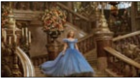
CINDERELLA (U) Mon 4th May

Join us for a feast of family-friendly entertainment during the May & Spring Bank Holidays including weekday and weekend matinees.