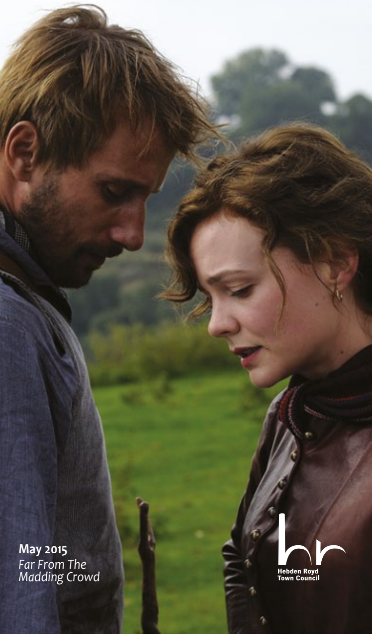
May 2015 Far From The Madding Crowd