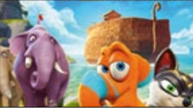
TWO BY TWO (U) Fri 29th to Sun 31st May