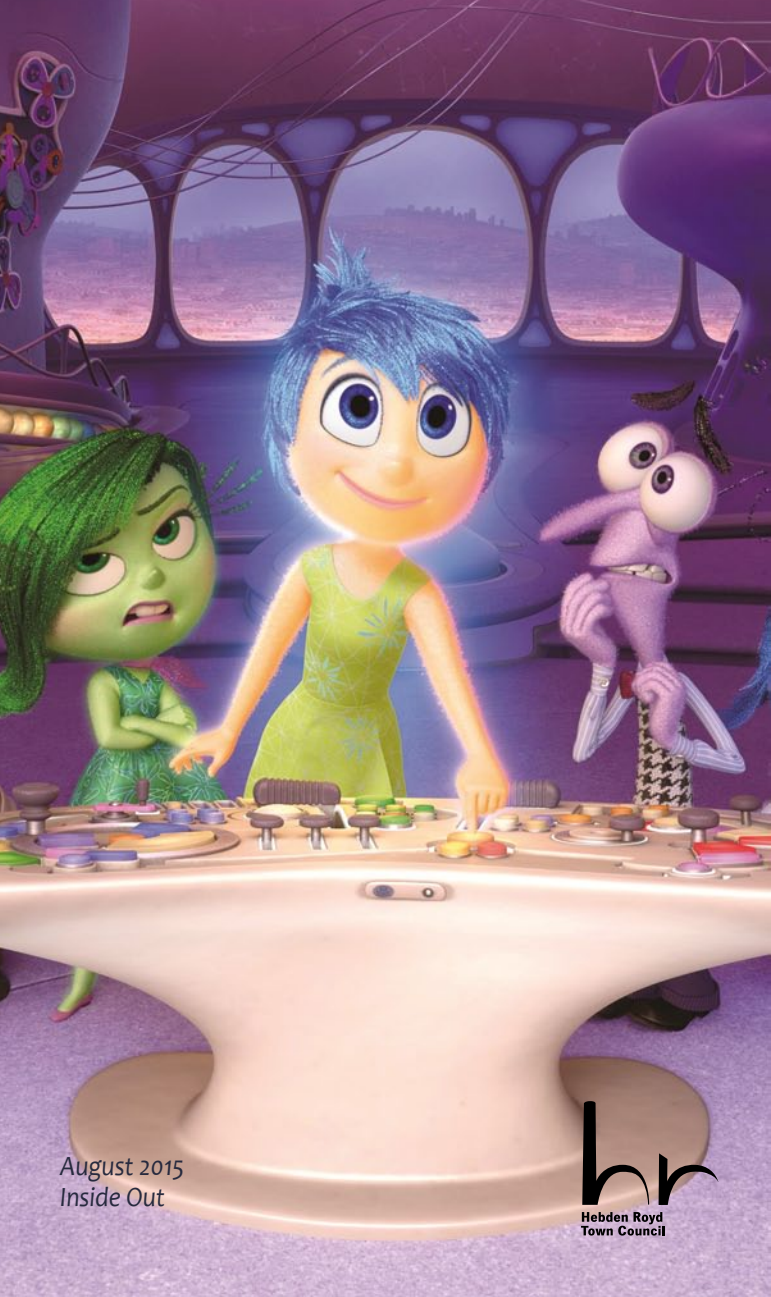
August 2015 Inside Out